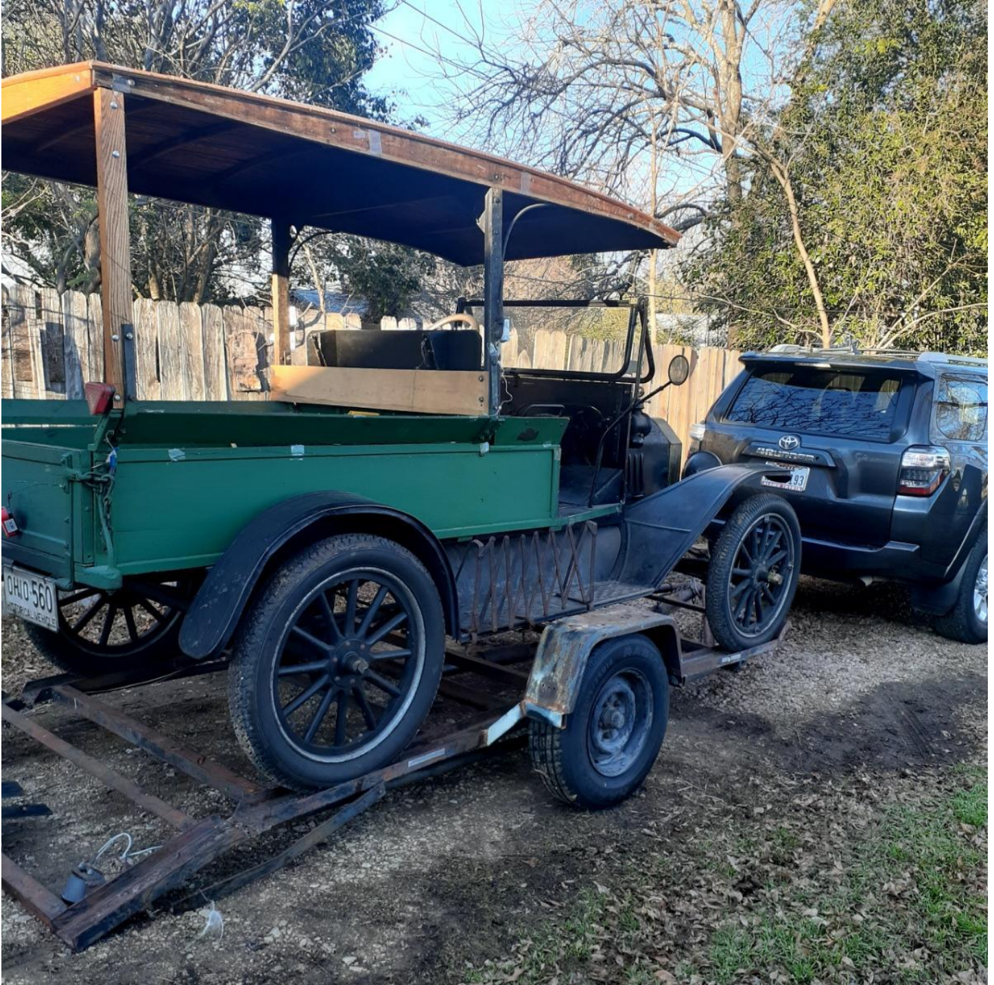
Wayne Mims' Vegetable / Fruit Truck