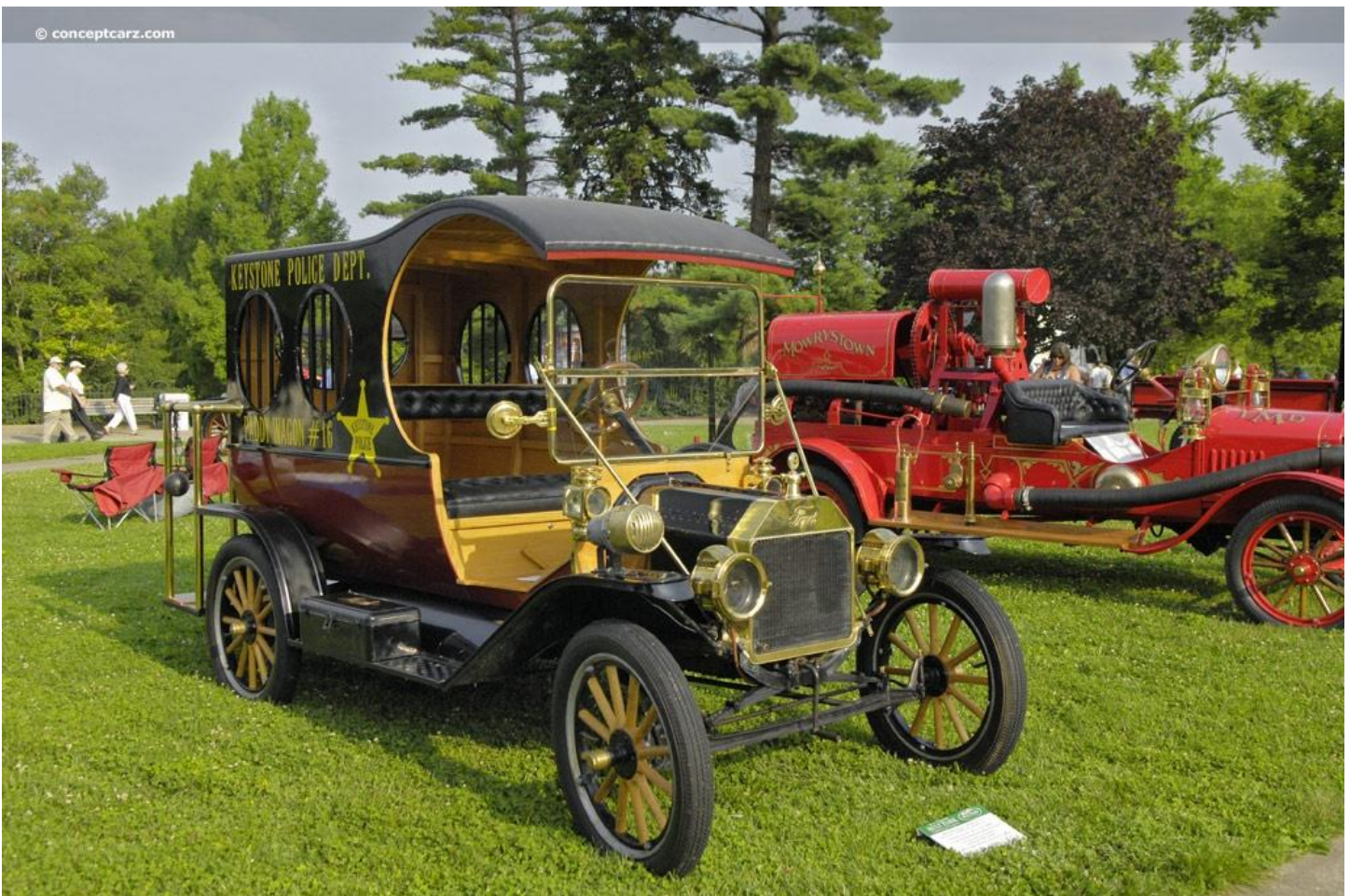
1912 Ford Model T Paddy Wagon

Let's hope none of us end up in this one