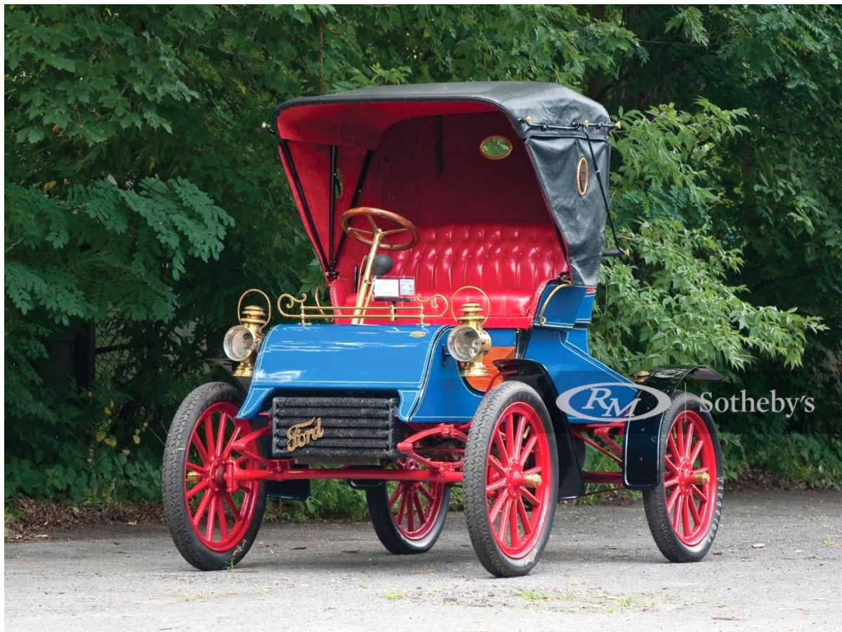
1903 Ford Model AC

Traffic lights are signaling devices positioned at road intersections, pedestrian crossings, and other locations to control flows of traffic. Traffic lights were first introduced in December 1868 on Parliament Square in London to reduce the need for police offers to control traffic. Since then, electricity and computerized control has advanced traffic light technology and increased intersection capacity. (To Be Continued in the next Newsletter)