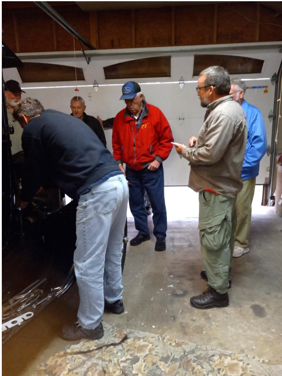
Tech Session at Treadwell's March 18 th