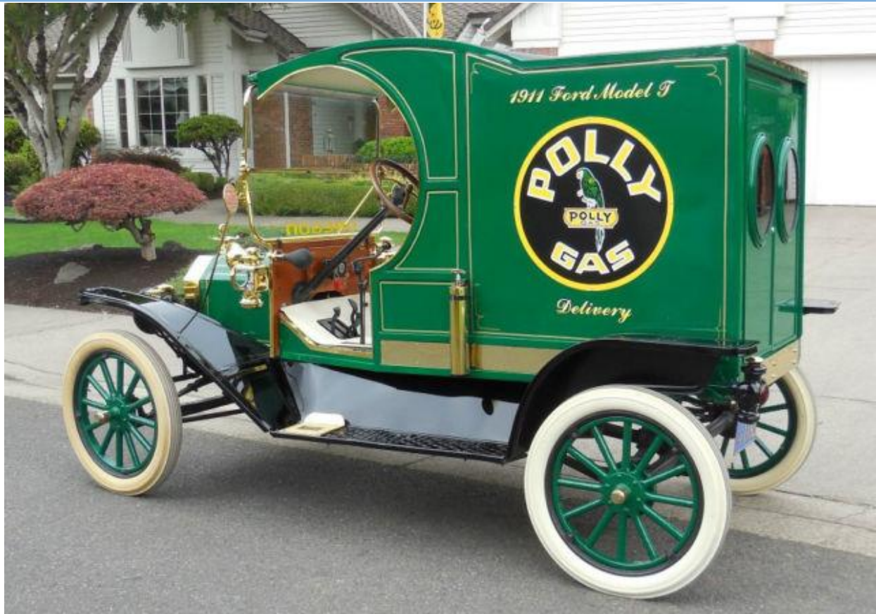
1910 Ford 'C-Cab' Truck