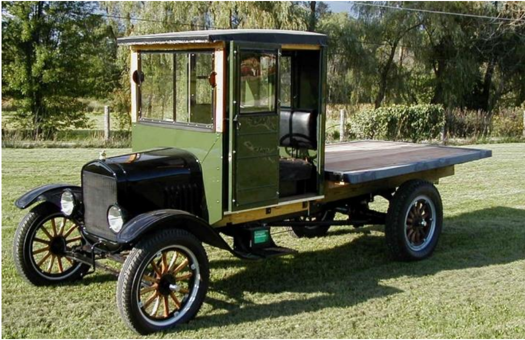
1900 Ford Truck