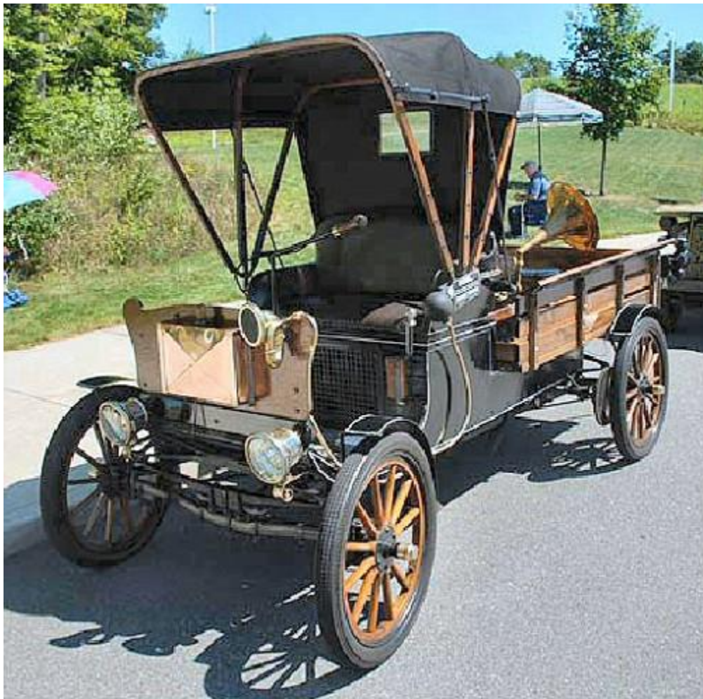
1902 Ford Truck