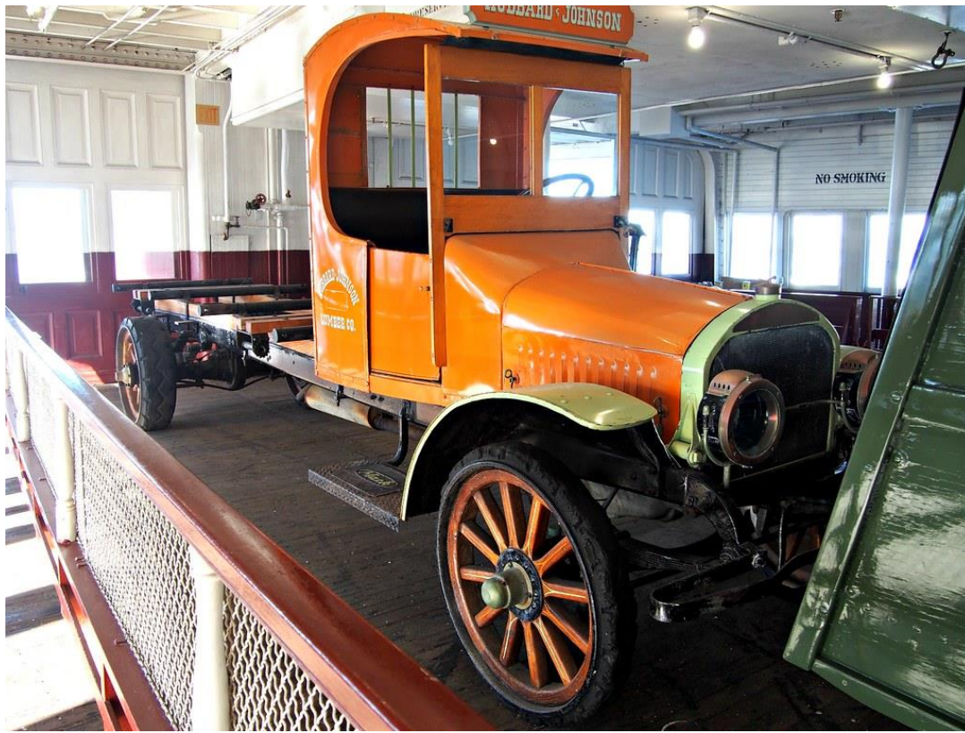
1890 Ford Truck

More Pictures I have of Early Ford Models