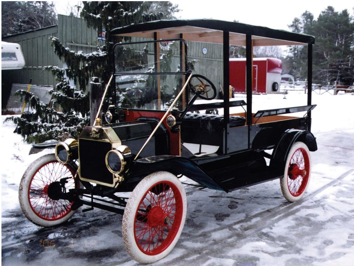
1914 Ford Model T Pickup