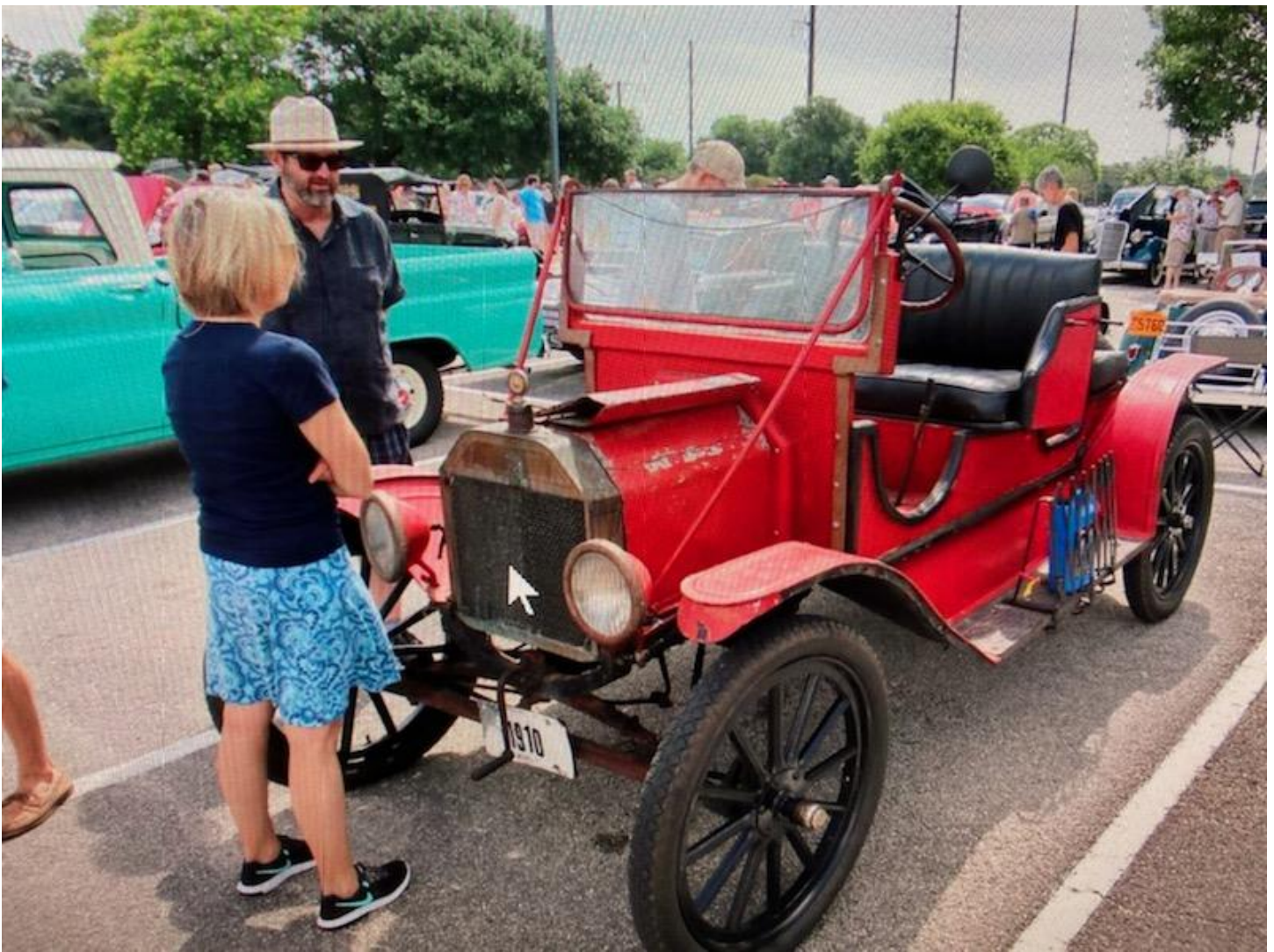
From the Father's Day Car Show – Date unknown