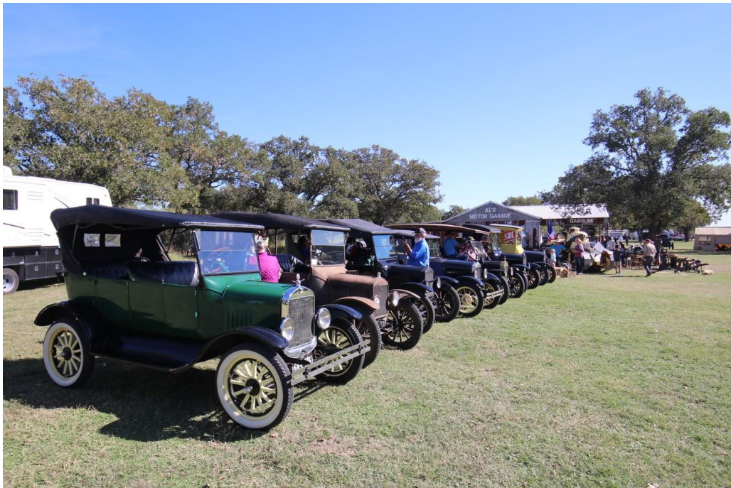
A Picture from last year's Kingsbury Fly-In -- The Model T lineup

We have an interesting program presented by the two owners, Maury Domengeaux and Steve Schlosareck that are rebuilding the stand alone building in Martindale that was once a Hupmobile dealership. It is across the street next to the vacant lot. It should be enlightening. You will want to hear it.