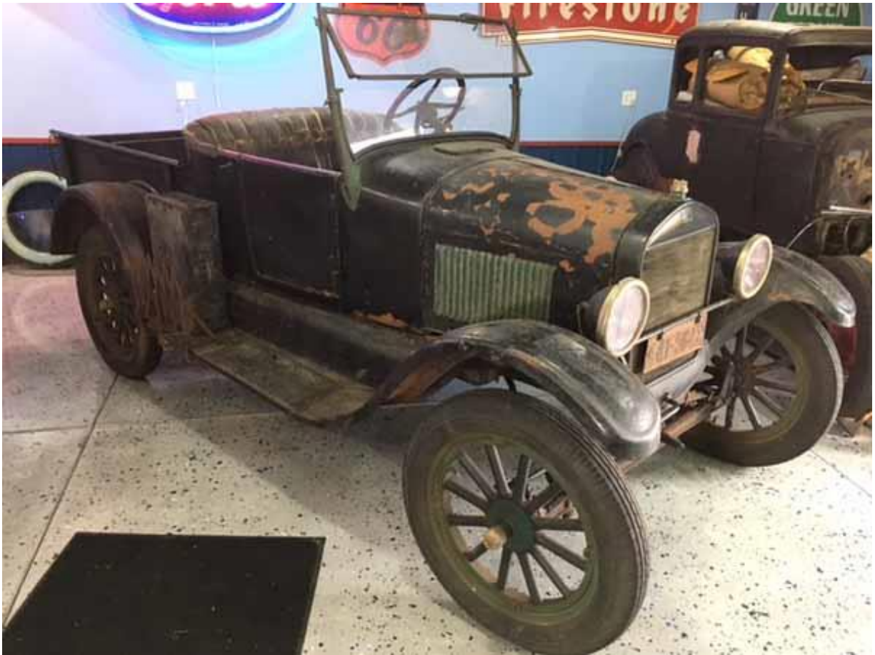
Glenn Shiller's 1926 Model T pick-up