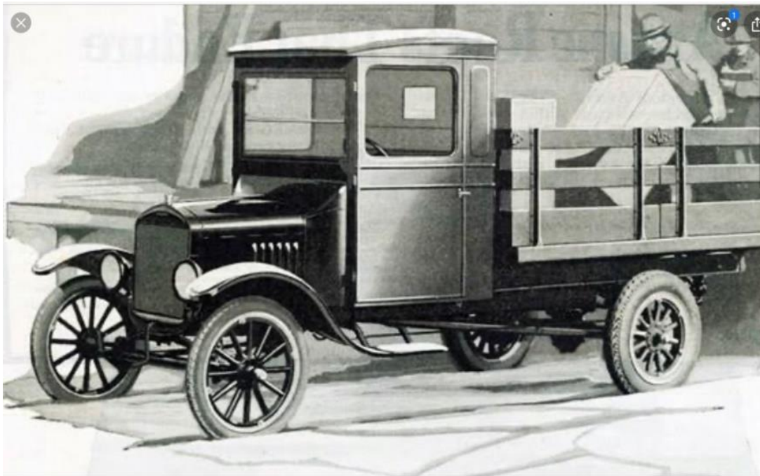
Ad for 1927 Model T Trucks in San Antonio, TX circa 1927