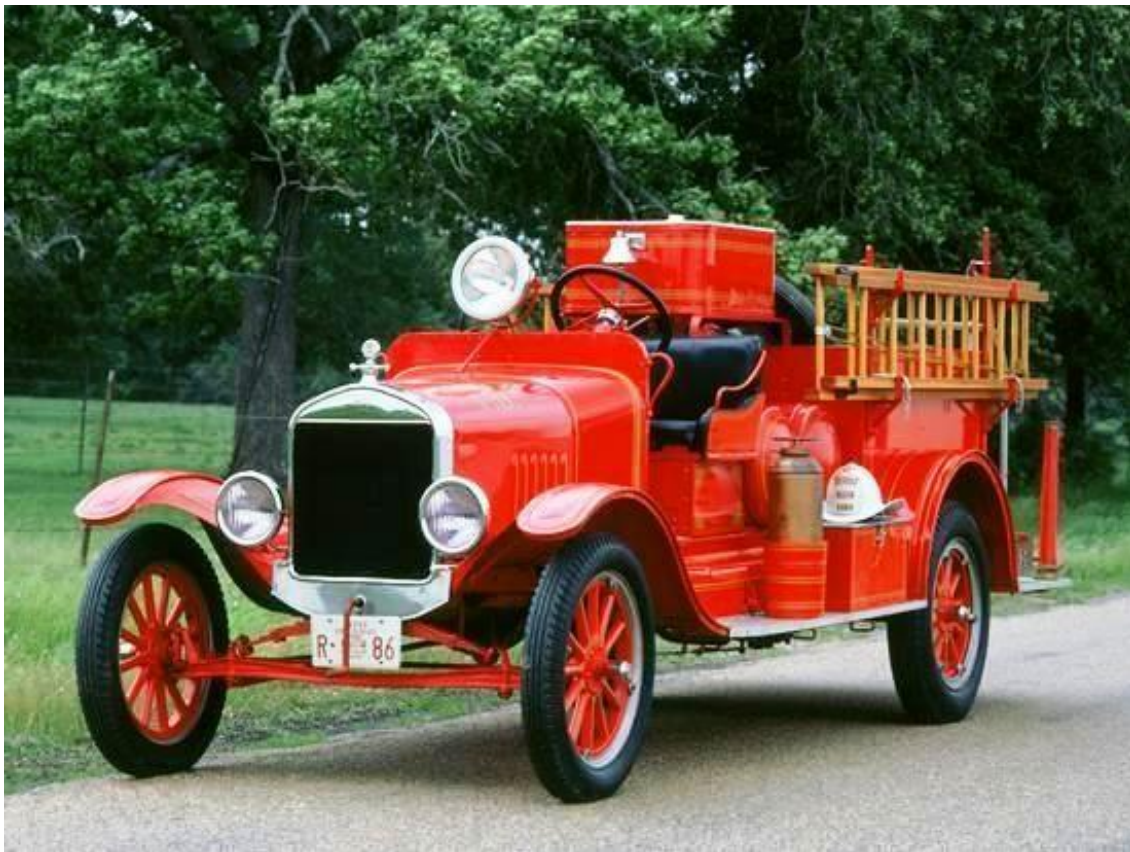
1927 Ford Model T Fire Truck

Did you know that 6 million Americans say that they have been abducted by aliens?