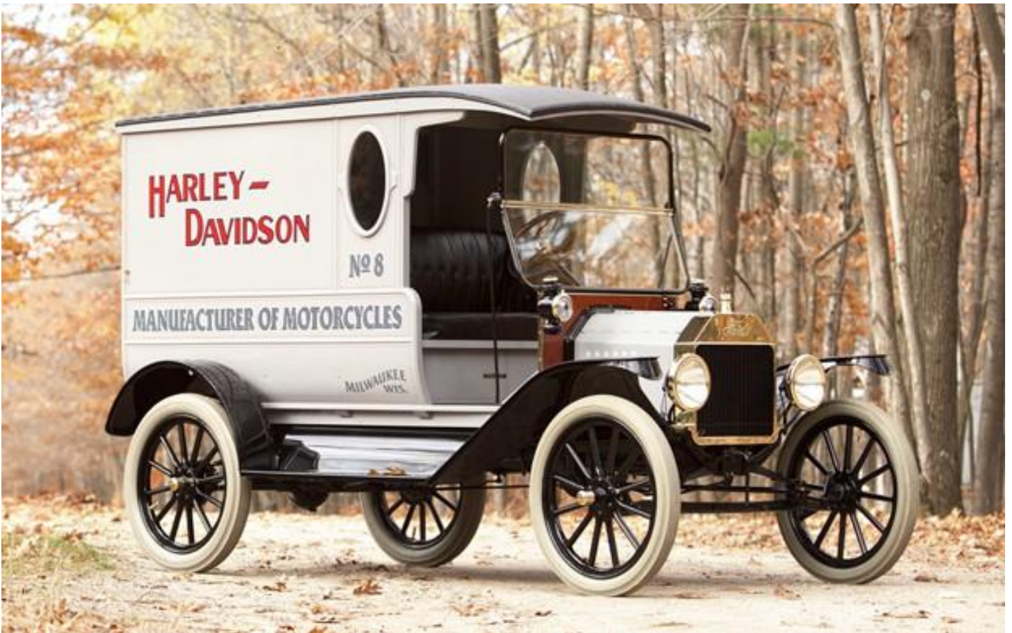
1916 Ford Model T Delivery Car

If I had asked what people wanted they would have said faster horses. Henry Ford